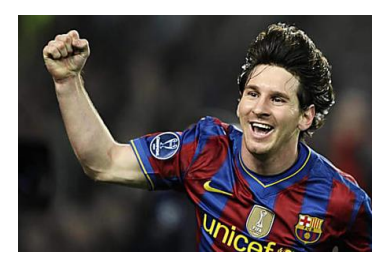
The 25 Highest-Paid Footballers in the World